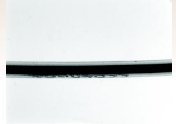
Acquired Solution Image

The object of this inspection is to constantly monitor the diameter of tubing as it comes off the production line. The BL2850, providing a long, narrow area of light, was chosen for its size and quality of light.