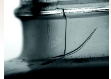
Acquired Solution Image

Light shining through clear plastic bottles shows cracks or other deformities within the bottles. The eight inch length of the BL41192 allows relatively large bottles to be inspected, sometimes using two or more cameras to provide more adequate coverage.