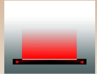
Light Function Diagram