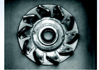
Acquired Solution Image

Inspecting an impeller after it is welded, the DL37100 creates sufficient contrast between the two metal sections, allowing the vision system to verify the blades are properly placed on the outer ring. Shadows cast by the upturned blades provide a way for the system to make measurements to determine that the blades are fully formed.