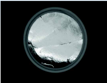
Acquired Solution Image